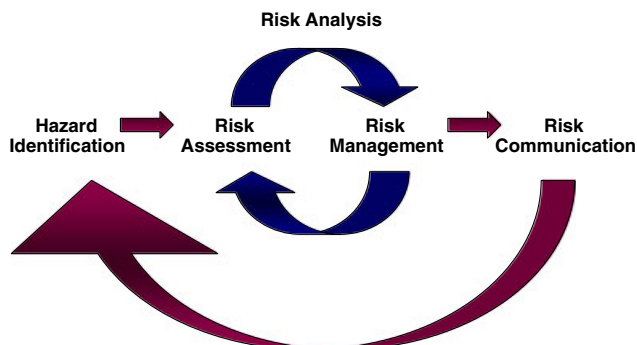
Fig. 2. Schematic of the Risk Analysis paradigm.

Given the conservation implications of measles infections in NHP populations in particular, and cross-species transmission of endemic human pathogens in general (especially other pathogens spread via the respiratory system, such as tuberculosis and influenza), it is important to consider the ways in which NHP populations can be protected from endemic human diseases. One approach to this issue is to use the risk analysis paradigm described by Travis and colleagues in this issue. In the present article we use the risk analysis framework to organize a discussion of what is known about human–NHP transmission of measles, what directions future research on the subject should take, and how these data can be used to reduce the risk of human–NHP disease transmission (Fig. 2). Two NHP populations with contrasting patterns of measles antibody seroprevalence will be used to illustrate the main points with respect to risk analysis.