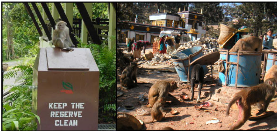
Fig. 4. The photo on the left is of the specially designed rubbish bins used in BTNR/CCNR. These bins are truly 'monkey-proof'. The photo on the right, taken at Swoyambhu, illustrates the difficulties in keeping monkeys out of open rubbish bins/piles.

Sampling bias may also explain the observed differences in measles seroprevalence in Swoyambhu and BTNR/CCR. Because not all groups of macaques at BTNR/CCR were sampled, it is possible that evidence of measles infection went undetected. However, this is unlikely because the macaques sampled were from groups with the most human contact. Furthermore, regular intragroup contact occurs at BTNR/CCNR, increasing the likelihood that measles infection in one group would spread to other groups and be detected by our serosurvey. It could also be suggested that measles actually does affect the BTNR/CCR macaques, but that it causes high mortality among affected