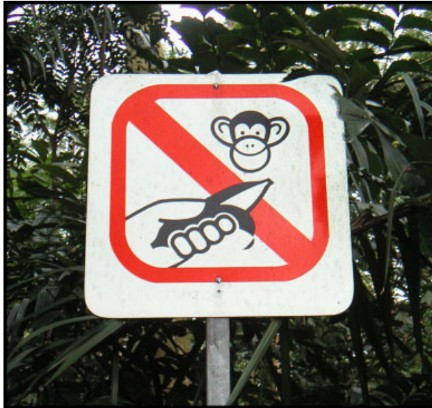
Fig. 3. Example of the signage used at BTNR/CCNR to discourage feeding of the monkeys.